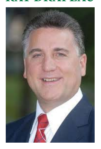
Dear Quail Run Residents,

I hope everyone is enjoying their summer and takes the time away from the more serious issues of the day. For me the summer is my busiest time because my day job is taking care of school buildings which are only available in the summer to do repairs and maintenance. I did take a trip out to Colorado to visit my daughter who is stationed there in the Air Force. I miss her very much and until you experience that long separation it can't be truly appreciated. I'm very proud of her service though and can assure everyone that in her position as a Physician Assistant she's taking very good care of our soldiers.