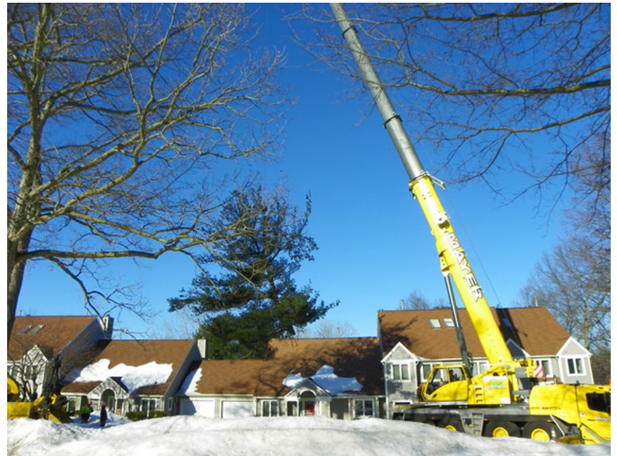
7— Lowering the tree top back to earth.