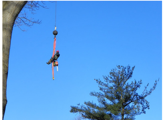
4—Hi Ho! It's off to work I go.

Thanks to the Mayer Tree Service for their professional removal of the nine trees at Douglass Green and Saw Mill Brook Way.