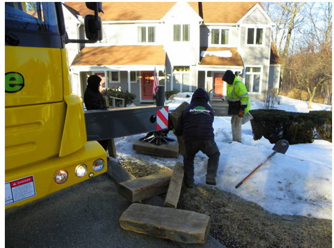
2—Crew stabilizes crane.