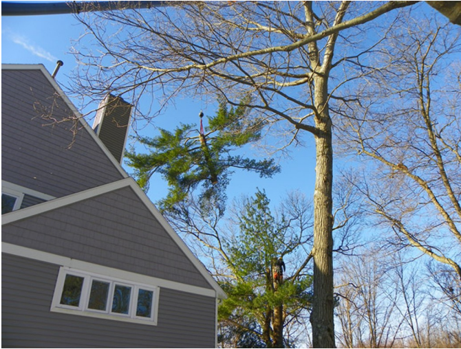
8—Lifting the second section.