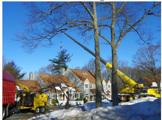
5—Workman goes over house and reaches tree

Thanks to the Mayer Tree Service for their professional removal of the nine trees at Douglass Green and Saw Mill Brook Way.