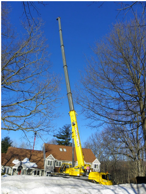
3—Reaching for the sky.