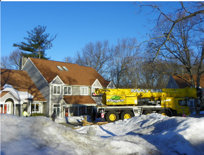
1—Crane and crew arrive.