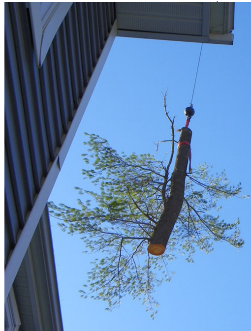
9— Lifting the third section.