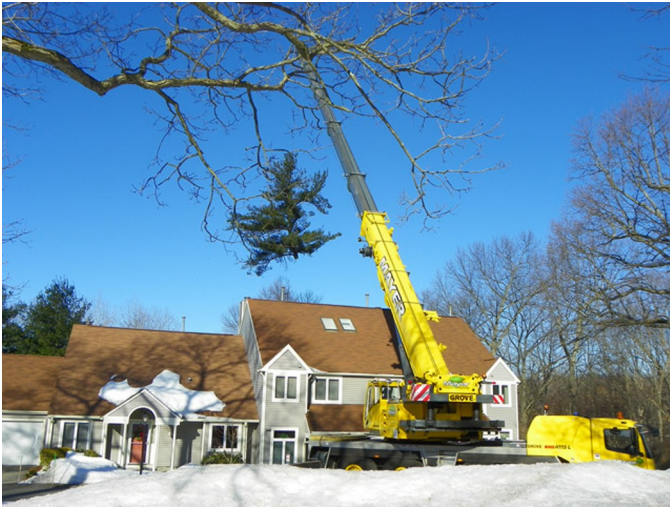
6—Up comes the first tree section.