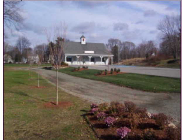
Plenty of Room to Park