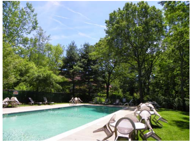
Pool views: May 31 at 12:30 p. m. (above) and July 31 at 2:00 p.m. . (below).

There will be additional tree pruning in the pool area before next summer.